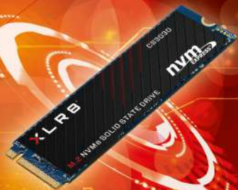
CS3030 NVMe Gen3x4