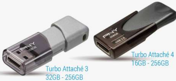
Turbo Attaché 3 32GB - 256GB