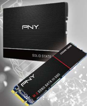
CS900 / CS2040 SATA III (6GB/s)