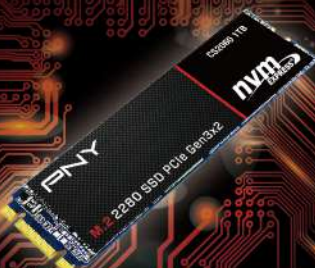
CS2060 NVMe Gen3x2