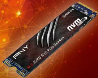
CS4040 NVMe Gen4x4